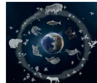
Fig. 6. Cyclicity of life

The narration is developing like a spiral explicating the changes from a simple sentence to compound unextended and compound extended syntactic structures. The preposition of occurs twice in the middle of the narration. And it is symbolic. The middle of the narration is like the central point of a Milky Way: