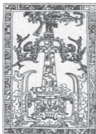
Fig. 2 The Milky Way in the Maya's imagining

The Oglala and Lakota Sioux , according to William K. Powers' book Oglala Religion 24 , believed that souls traveled along the so-called 'Ghost Road' or the Milky Way. They go until they meet an old woman who judges the soul's life on earth and sends it on to the other world or back to earth to be a shade 25 . The light in the Milky Way is the campfires of ghosts on the road 26 .