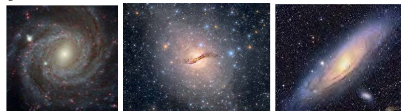
Fig. 4. Verifications in a design of the Milky Way

Thinking over the concept of Milky Way the first thing that comes to our mind is our perception of its image as a sign in the sky. It may be of different design. Let's look at some images of it given below: