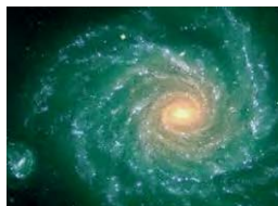
Fig. 5. The image of Milky Way

https://en.wikipedia.org/wiki/Milky_Way#/media/File:UGC_12158.jpg